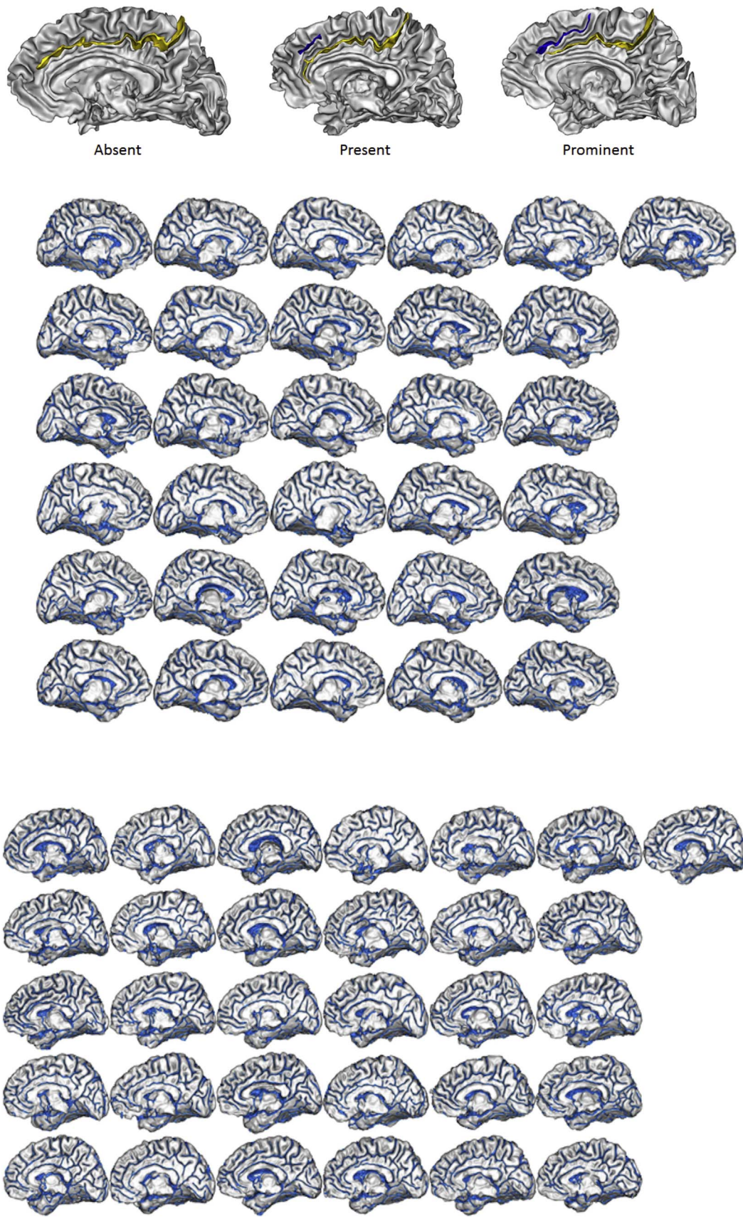
Fig. 1. Morphological patterns of the anterior cingulate cortex (ACC). The three ACC sulcal patterns: 'absent', 'present' and 'prominent'. The ACC sulci (yellow) and the paracingulate sulci (blue) are represented on the cortical surface (gray/white interface).